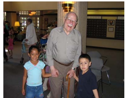
Some of the people served by the Felician Sisters' ministries

The "Touching Lives" event will be held at 7:30 a.m. at the Clarion Hotel, 5311 S. Howell Avenue in Milwaukee. A continental breakfast will be served.